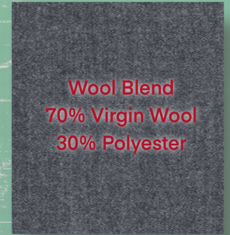
Wool Blend 70% Virgin Wool 30% Polyester