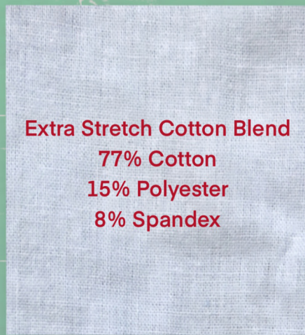
Extra Stretch Cotton Blend 77% Cotton 15% Polyester 8% Spandex