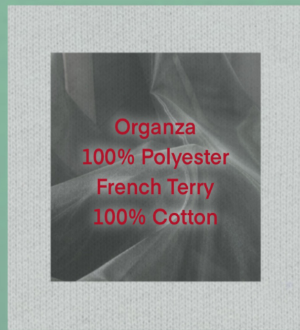
Organza 100% Polyester French Terry 100% Cotton