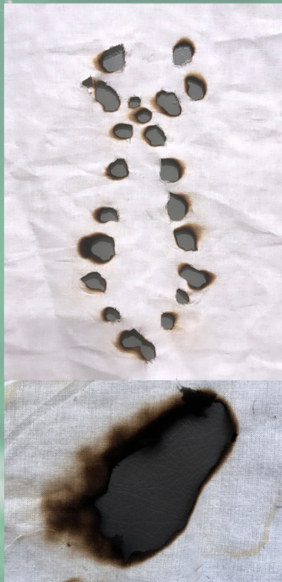
Holes Burned in the Shape of a Necktie which is Used in a Few Garments