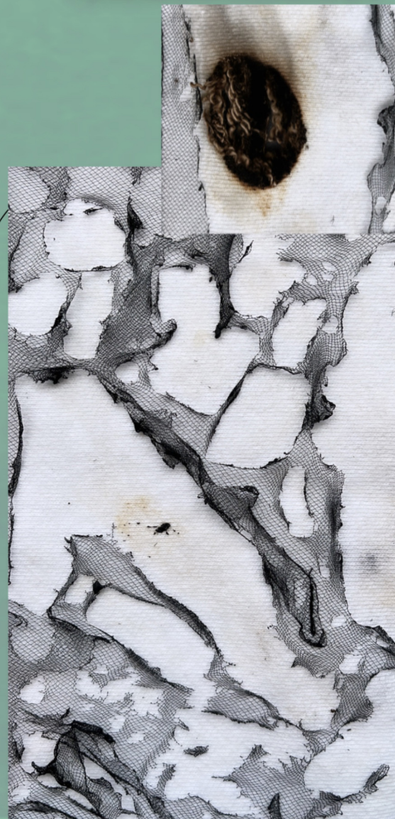
Organza Layers are Layered Over French Terry & then Lightly Burned Through to Create Effect