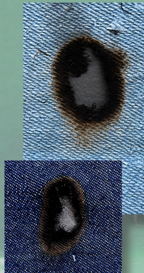
Holes Burned in Different Shades of Blue Denim