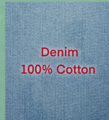
Denim 100% Cotton